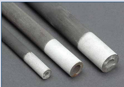
Silicon Carbide Resistive Heating Elements