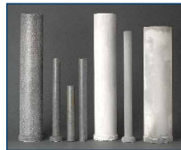
Nitro-SiC™ Nitride Bonded Silicon Carbide Shapes