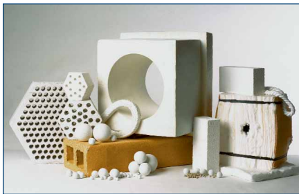
Various Refractory Items

Manufacturer and distributor of quality industrial ceramic products.